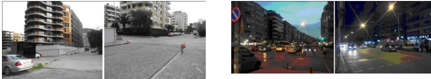
Figure 3 : Public Access Points of Zone 2 and General View from Zone 3.

Through the study, the questionnaire had been responded by the 90 residents (30 for each zone) in order to find out how perceived safety varies according to gender and varied economic, social, as well as environmental features. The SPSS software has been used and frequency analyses were made for analysing the results of the fear of crime survey.