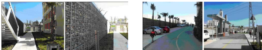
Figure 2 : Security Precautions of Zone 1.